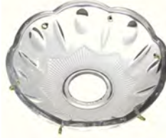
Pressed Glass Bobeche, 7/8" center hole.