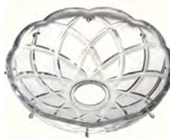
Pressed Glass Bobeche