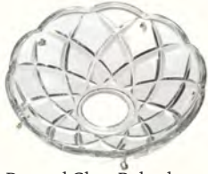
Pressed Glass Bobeche, 7/8" center hole dia. Reg. Ea 6 Asst 24 Ast