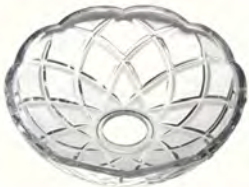
Pressed Glass Bobeche, 27mm (1 1/16") center hole. U11760 - 8" dia., No pins 6 Asst..... 9.75 24 Asst..... 9.55