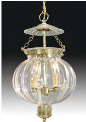
Brass, polished and lacquered finish