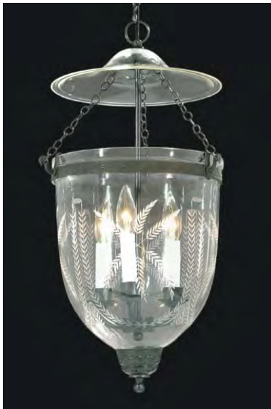
"Laurel Swags" copper wheel cut hall lantern w/ antique brass finish