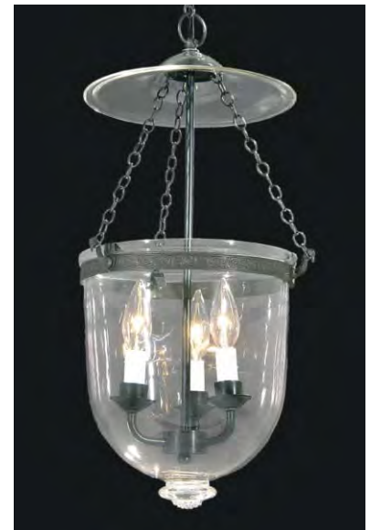
"Clear Hall Lantern" w/ pressed glass "bob" & antique brass finish No. 69522C – Small Hall Lantern, Clear No. 69521C – Medium Hall Lantern, Clear No. 69520C – Large Hall Lantern, Clear