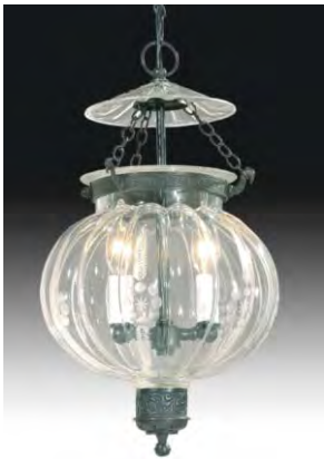
Antique brass finish