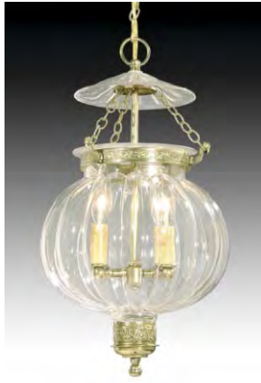
Brass, polished & lacquered finish