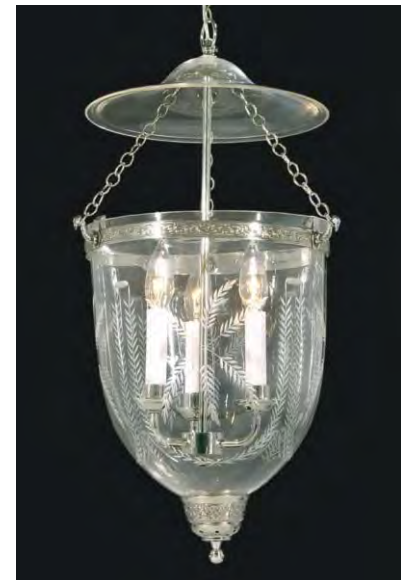
"Laurel Swags" copper wheel cut hall lantern w/ pewter finish