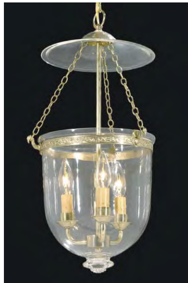
"Clear Hall Lantern" w/ pressed glass "bob" & brass, polished & lacquered finish No. 69522B – Small Hall Lantern, Clear No. 69521B – Medium Hall Lantern, Clear No. 69520B – Large Hall Lantern, Clear