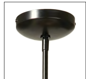
69134 - Satin Black