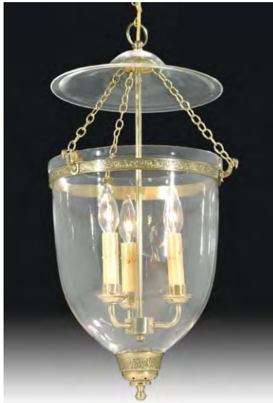
"Clear Hall Lantern" w/ brass, polished & lacquered finish No. 69551B – Small Hall Lantern, Clear No. 69550B – Medium Hall Lantern, Clear No. 69549B – Large Hall Lantern, Clear