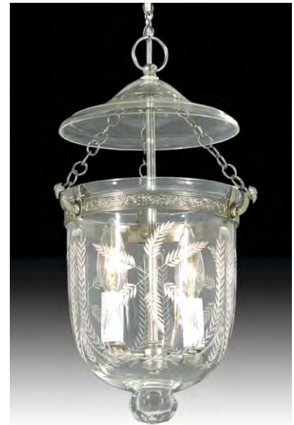
Tiny hall lantern with "Laurel Swags" copper wheel cut design. Your choice of hardware finishes.