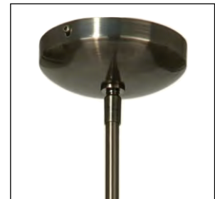
69132 - Antique Brass