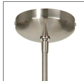
69131 - Brushed Nickel

Fixtures are wired and shipped knocked-down as a kit with additional rods for adjusting the ceiling drop to 18 1/2", 24 1/2", 30 1/2", or 48 1/2"