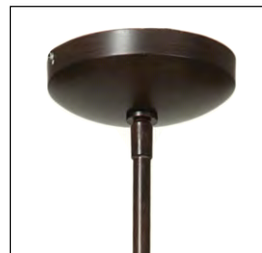
69133 - Antique Bronze