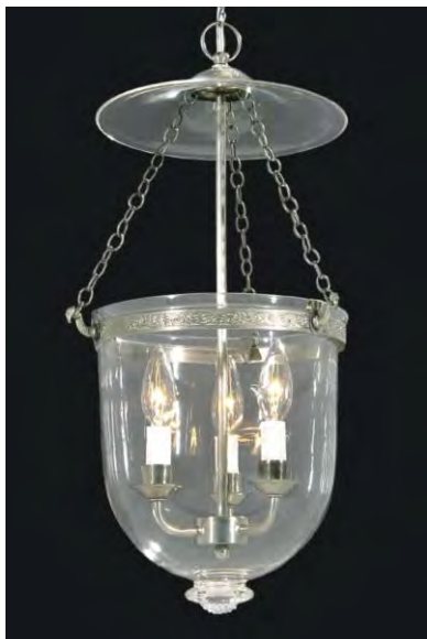
"Clear Hall Lantern" w/ pressed glass "bob" & pewter finish No. 69522P – Small Hall Lantern, Clear No. 69521P – Medium Hall Lantern, Clear No. 69520P – Large Hall Lantern, Clear