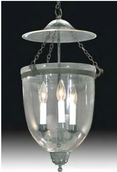
"Clear Hall Lantern" w/ antique brass finish No. 69551C – Small Hall Lantern, Clear No. 69550C – Medium Hall Lantern, Clear No. 69549C – Large Hall Lantern, Clear