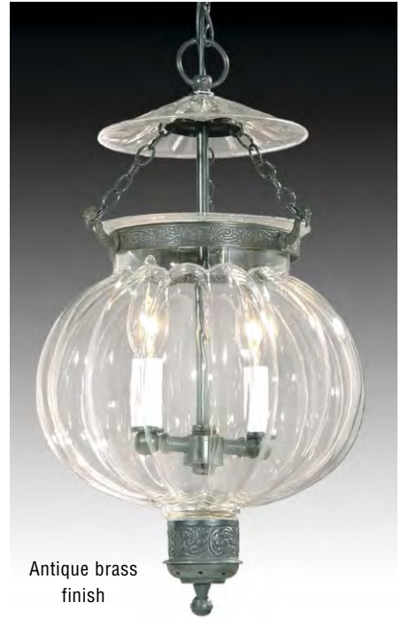
Antique brass finish