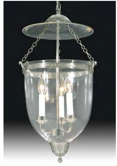
"Clear Hall Lantern" w/ pewter finish No. 69551P – Small Hall Lantern, Clear No. 69550P – Medium Hall Lantern, Clear No. 69549P – Large Hall Lantern, Clear