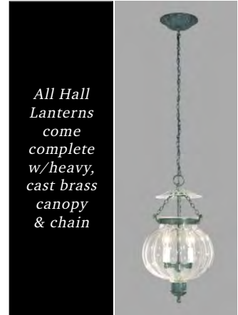
All Hall Lanterns come complete w/heavy, cast brass canopy & chain

We ship these lanterns electrified. There is a small amount of assembly required on the customer's part since the glass components are packed separate from the brass components to avoid damage.