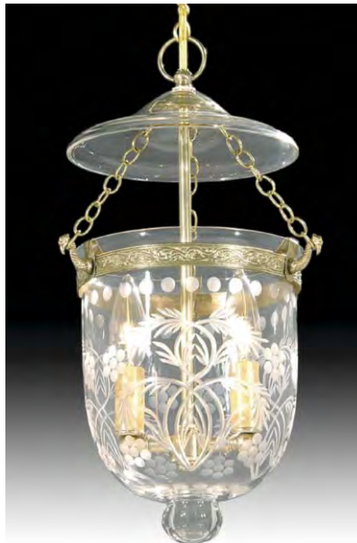
Tiny hall lantern with "Floral Foliate" copper wheel cut design. Your choice of hardware finishes.