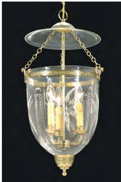
"Laurel Swags" copper wheel cut hall lantern w/ brass, polished & lacquered finish