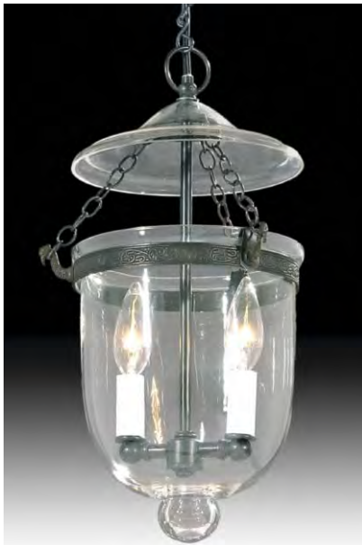
Tiny hall lantern with clear glass dome. Your choice of hardware finishes.

"Tiny Hall Lantern" 7" x 9 1 / 4 " deep dome, adjustable drop from 20 1 / 2 " to 39". This size recommended for 8' and 9' ceilings. All fixtures on this page are U.L. Listed